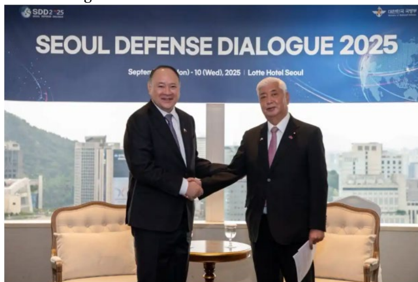
Defense Secretary Gilberto Teodoro Jr. and Japanese Defense Minister Nakatani Gen discuss preparations for the Reciprocal Access Agreement’s implementation during a meeting on Tuesday on the sidelines of the Seoul Defense Dialogue.