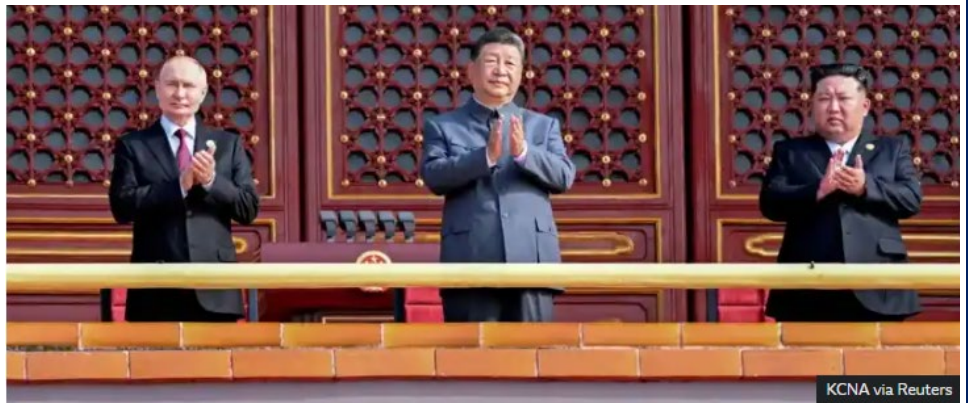
Russia's Putin, China's Xi and North Korea's Kim met in Beijing earlier this month